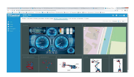
Web portal screenshots